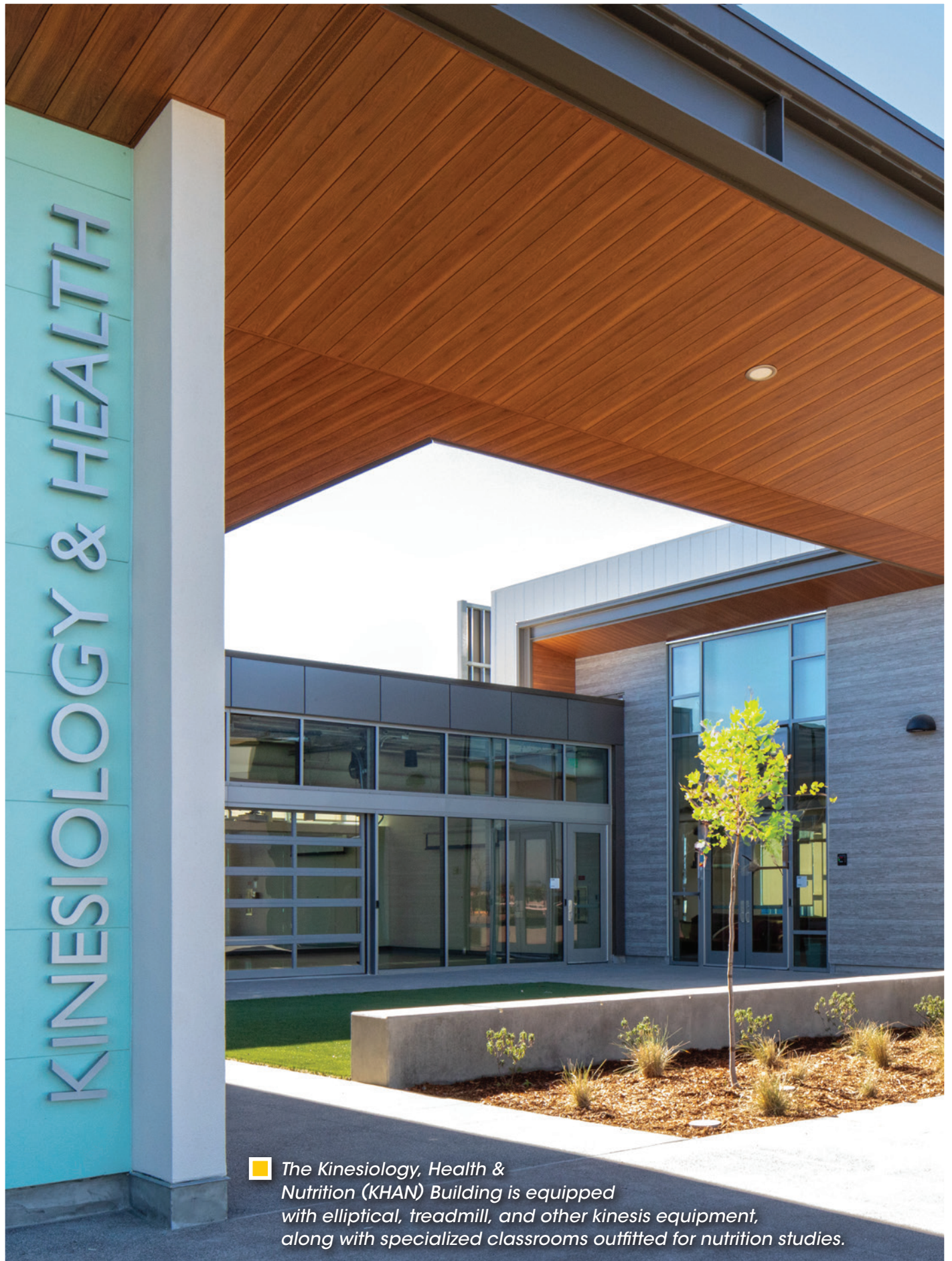
■ The Kinesiology, Health & Nutrition (KHAN) Building is equipped with elliptical, treadmill, and other kinesis equipment, along with specialized classrooms outfitted for nutrition studies.